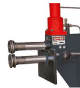
Optional Hydraulic Top Roll (BRM 2.5 / BRM 4)