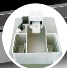
Waste-Oil Removing Device