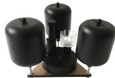
Floating oil collection seat set (optional)