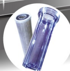
Filter Needs no Change