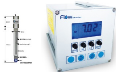
PH Monitor System-(Optional)