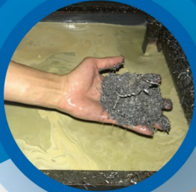
Uncleaned - Aluminum Scrap