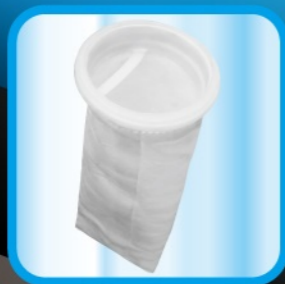
Consumables - Filter Bag (100um)