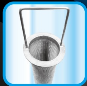
No Consumables - Stainless Steel Filter (190um)